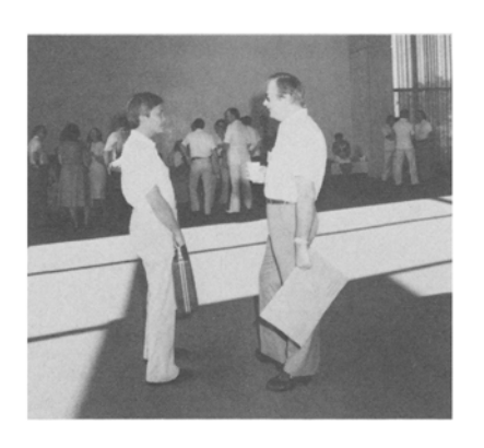
124 / JAOCS March 1981